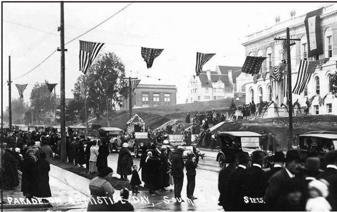
The float "In Memoriam" in the center of photo was the prize winning float.

The parade was a most agreeable surprise, for probably nine out of ten persons in the great crowd that thronged the streets had expected there would be but little showing on account of the rain. As a matter of fact, the big procession was fully a mile long, and the decorations and flowers, like the spirits of those taking part, were of a brightness and cheer that made the spectators forget the rain.