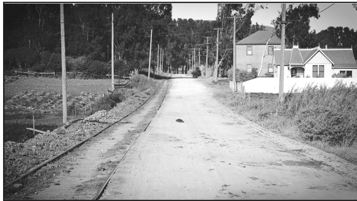
Oak Avenue. South San Francisco Railway Line on left. September 10, 1913