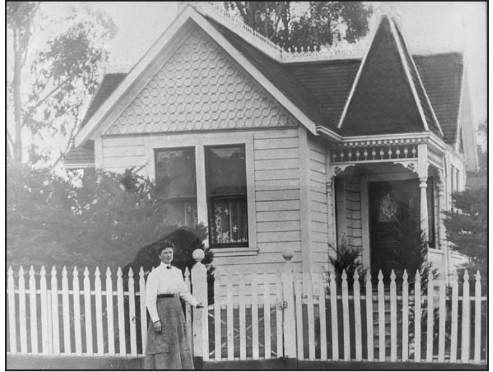
Irene Weiss in front of 61 Oak Avenue. Taken by a "roving photographer."

The Weiss home and other structures on Oak have since been demolished to make way for new housing.