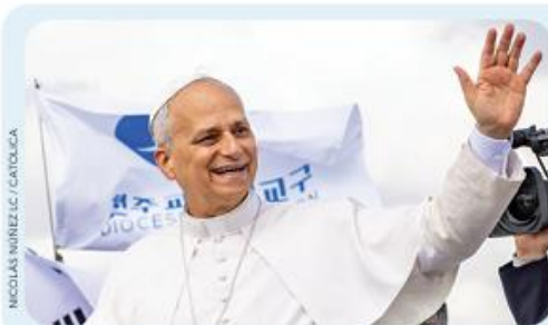
NICOLAS NUNEZ/CC / CATHOLICA