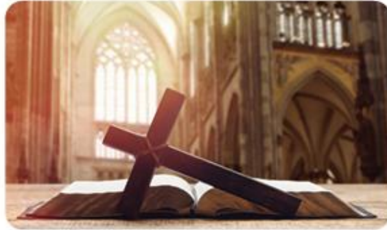
ILLUSTRATION BY SOLGOWA/ISTOCK

No one but our heavenly Father knows the precise time of our Lord's return. (See Mark 13:32-37.) If this uncertainty about when Jesus will return evokes more apprehension than anticipation, it doesn't help that prophets of doom make predictions based on a distorted understanding of apocalyptic literature in the Bible. An example of this literary form includes the Book of Revelation. It contains elements of a final judgment and cosmic struggle between good and evil written in highly symbolic and imaginative language; however, it wasn't intended to provide a literal description or timeline of how the world ends. In 1 Thessalonians 4:16-17, St. Paul also uses apocalyptic imagery to say that all the faithful will be "caught up" ("rapt up") to meet the Lord at his Coming. Some use this single text to vividly imagine true believers being "raptured" from the earth and escaping the destruction of humankind at the end times, but it's a misinterpretation. For Catholics, these apocalyptic passages offer hope and guidance: despite the powerful forces of evil, Christ will overcome. His death and resurrection already ushered in the last age. We don't know how long this age will last before the final consummation, hence the need to be watchful and prepared. ●