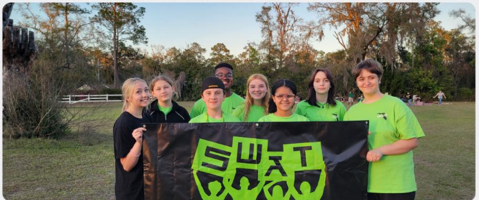
Wakulla SWAT Youth

A virtual training hosted by our Regional Youth Advocacy Board where SWAT youth connect online to strengthen leadership skills, build advocacy confidence, and learn new strategies to support healthier, tobacco free communities. This interactive session helps members grow, collaborate, and return ready to make an impact.