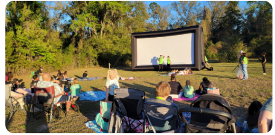
Wakulla Middle School