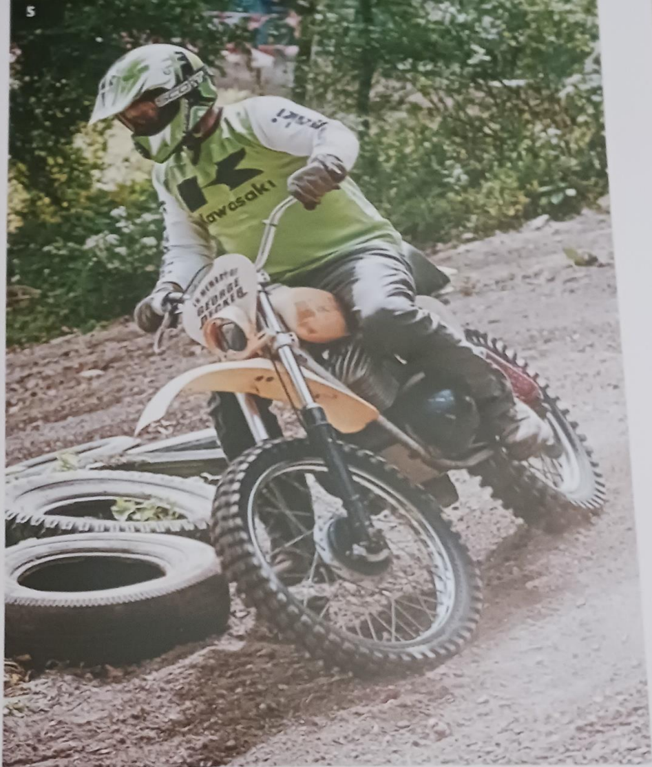
Captions: 1. Hundreds of bikes showed up for the event. 2. Most bikes were twinshock but some more modern bikes also attended. 3. Good to be back. 4. It was popular. 5. Rokon, I assume? 6. Husky hero. 7. Everyone was eager to get out on the track. 8. A momentous occasion. 9. Modie, and red, green, yellow.