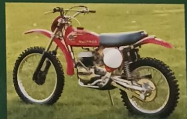
BULTACO PURSANG 200

Farewell Super Hunky Honda XR350 KTM125 RV Sandriders 2023