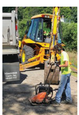
Students at their co-ops in Becket and Berlin.