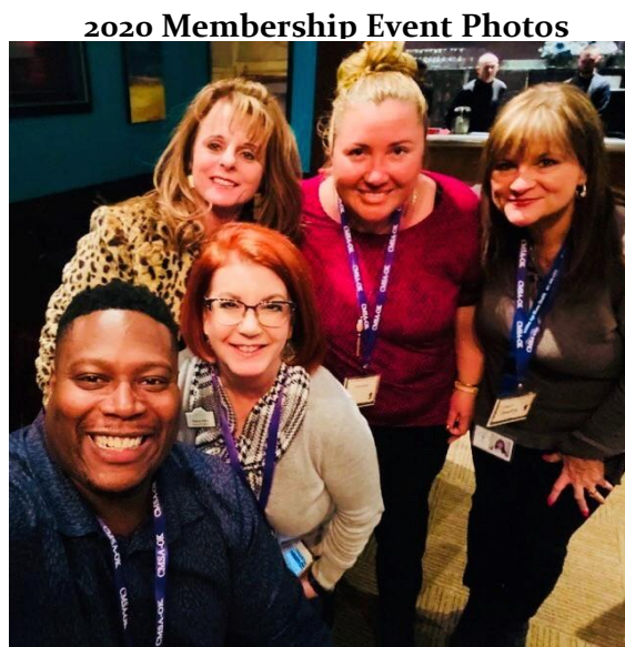
2020 Membership Event Photos