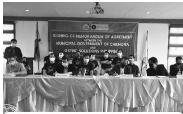
PROGRAMANG LGU ENBIS, ITATAGUYOD SA CARMONA

peared to be unfazed by the persistent criticism. This time, he alleged that progressive organizations have Belgian backers helping them to recruit children to the armed struggle. Defense Secretary Delfin Lorenzana earlier admitted Lt. Gen. Antonio Parlade Jr. may have "overstepped" with his comments about Inquirer.net reporter Tetch Torres-Tupas. The defense chief said he has directed the AFP leadership to talk to Parlade so that a similar incident may be prevented in the future. Parlade, chief of the Southern Luzon Command who also serves as spokesperson of the National Task Force to End Local Communist Armed Conflict (NTF-ELCAC), called Torres-Tupas a "propagandist" over an article she wrote on two Aetas seeking to join petitions against the anti-terrorism law. The report contained the Aetas' narration they were tortured by the military and falsely charged of terrorism. This legal document