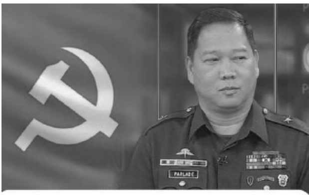
PARLADE CONTINUES RED-BAITING CLAIMS, ALLEGES EXISTENCE OF CPP FUND SCAM

The high-ranking military official in hot water for red-baiting a journalist ap-