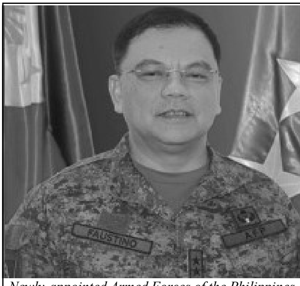
Newly-appointed Armed Forces of the Philippines

101st Infantry Brigade to ask permission to mount an attack. His request was granted as the brigade also positioned two to three tubes of 105mm howitzers ready to fire if needed.