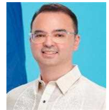
Sen. Alan Peter Cayetano

The first pillar of the framework is Purpose. Cayetano shared that