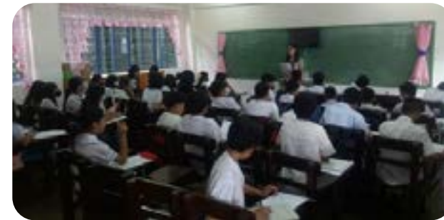
has so far resolved at least 120 cases of bullying.

“But you know, pagdating kasi sa ganitong reporting system, dalawa iyan eh, puwede kang magsabing yes, naka-resolve ka ng 120 cases pero (when it comes to such reporting system, there are two things we need to consider. Yes, we could say we’re able to resolve 120 cases but) we still don’t know if there is underreporting going on,” Poa said.