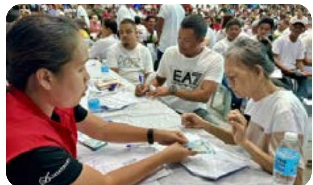
tral Office, satellite offices and the various field offices,” he said.

“Rain or shine, our hard-working social workers are always ready to render assistance to those in need. The only consideration for the distribution of aid for the indigent and those in crisis situations is their current circumstance as assessed by our social workers in the DSWD Cen-