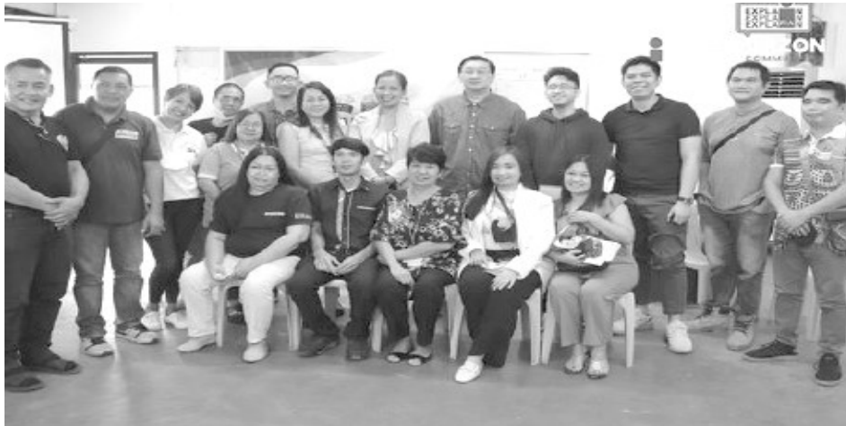
The Department of Agriculture (DA) IV-A during its September 27 DA CALABARZON Kapihan in Calamba City, Laguna, educates over 15 media organizations representatives about organic agriculture.

"We're trying to rejuvenate ang ating mga lupa na nasusunog na because of using synthetic fertilizer and nagca-cause ng polusyon sa atin. Ikalawa, yung health natin. Kasi yung kinakain natin sa ngayon, di'ba binobomba po yan ng synthetic fertilizer. Pero kita ninyo, magca-cause po talaga