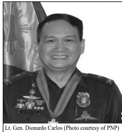
Lt. Gen. Dionardo Carlos