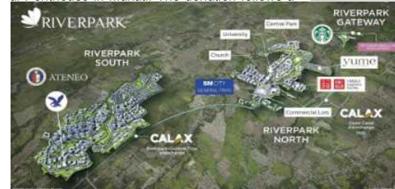
memorandum of agreement signed by the two sides in October 2025.

The new Ateneo campus is expected to bring its education