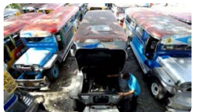
organized and reliable transport system," he said.

"We believe that a stable income will not only benefit the drivers but will also contribute to a more