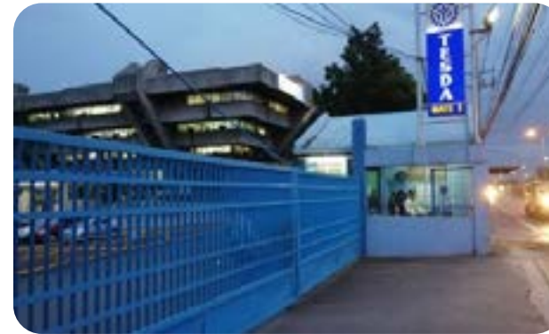
said in a news release.

"Yet another proof of TESDA's pursuit of innovation and excellence in TVET (Technical and Vocational Education and Training) is the adoption of the extended reality (XR) technology in the implementation of training and assessment," the TESDA