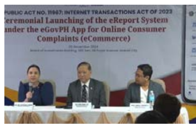
Tracking of Complaints) of Republic Act No. 11967 or the Internet Transactions Act of 2023.

The system is part of the implementation of Section 9 (Referral and