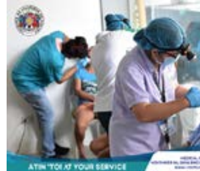
leaders and healthcare partners to the welfare of the community.

With the LAB for ALL program’s backing, the mission provided medical services to 458 individuals, dental care to 62, and specialized x-ray and ECG diagnostics to 21 residents. Medical and