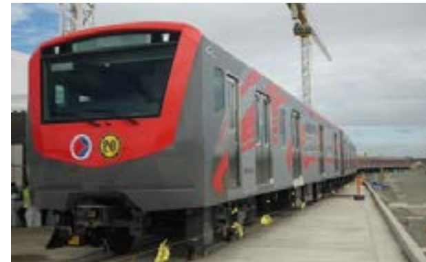
NEW TRAIN. One of the new trains of the Philippine National Railways - Clark Phase 1 during an inspection in Valenzuela City on Jan. 26, 2022. Transportation Secretary Jaime Bautista said Friday (Nov. 24, 2023) that the North-South Commuter Railway and the South Long Haul projects would usher in a "renaissance" in the country's railway sector, providing jobs, boosting the economy, and providing connection across the country.

in a "renaissance" of the country's rail industry and would provide connectivity, as the two rail projects will link Metro Manila to regions in northern and southern Luzon.