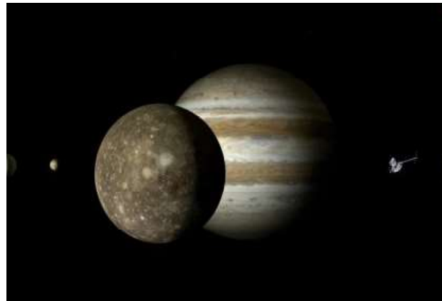
HOUSTON, Texas – Are there life forms on other planets beyond Earth? Scientists believe the answer could be found on Jupiter’s moon, Europa, according to research published Tuesday by nature.com.

face elevation and radar sounding data to show the “double ridge was formed by successive refreezing, pressurization, and fracture of a shallow water sill within the ice sheet” and “that shallow liquid water is spatially and temporally ubiquitous across Europa’s ice shell.”