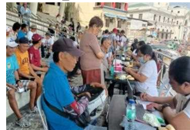
AGRI AID. The Department of Agriculture in Western Visayas releases the Presidential Assistance for Farmers and Fisherfolk Program at the Iloilo Freedom Grandstand in Iloilo City on April 16, 2026. Regionwide, the measure targets to serve over 380,400 farmers and fisherfolk.