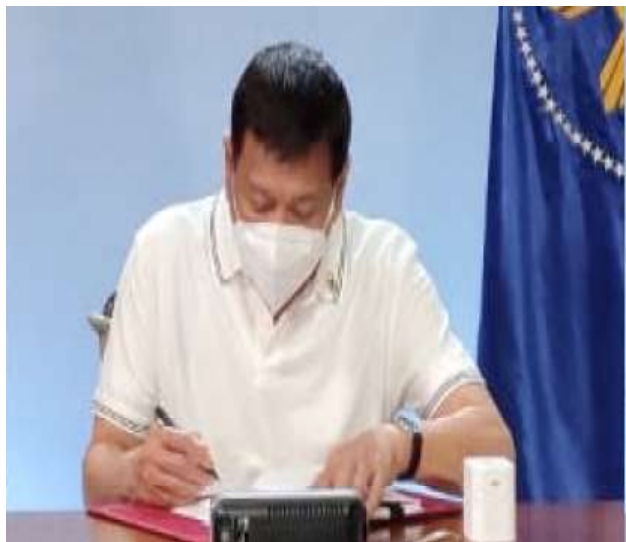
President Rodrigo Roa Duterte (File photo)

claims among different claimants, the parties may seek the proper administrative and judicial remedies.