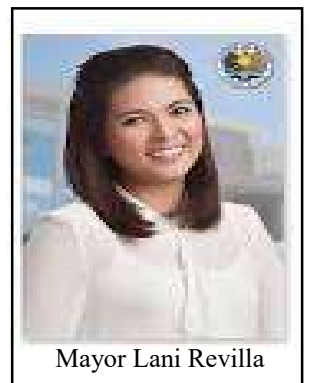
Mayor Lani Revilla

The order also states that the Zapote 1 Barangay Health Emergency Response Team (BHERT), in coordination with the City Health Office (CHO) and the City Contact Tracing Team (CTT) shall continue to carry out inventory and surveillance of the concerned households in this critical zone, conduct case finding and investigation in search of more household members