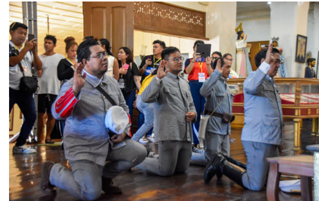
Image 2: Reenactment of Gen. Aguinaldo's oath as President of the 1st Republic at the Shrine of St. Augustine and Parish of Holy Cross in Tanza

Pagkatapos sa Tanza, nagtungo ang grupo sa bayan ng