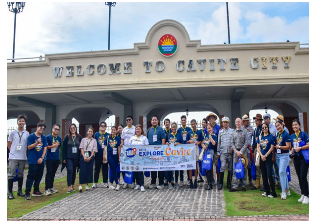
Image 4: Tara, let's explore Cavite participants at Cavite City Hall

Matapos ang tanghalian, ipinagpatuloy ng grupo ang heritage tour sa mga makasaysayang lugar sa Cavite City. Una nilang bisita ang Ladislao Diwa Shrine, ang pinagalagaang ancestral home ni Don Ladislao Diwa, isa sa mga nagtatag ng Katipunan. Dahil sa kanyang mahalagang papel sa Rebolusyong Pilipino, idineklara ng