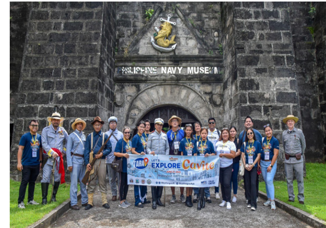
Image 5: Tara, let's explore Cavite participants at Fort San Felipe, Cavite City

Malalim ang aming paniniwala na ang pamana ay dapat aktibong maranasan at hindi lamang alalahanin. Ang Cavite ay isang probinsyang maraming kwento na malaki ang naging impluwensya sa kasaysayan ng ating bansa. Nais ng Biyaheng South's "Tara! Let's Explore Cavite" na pangalang at ilawan ang mga mahahalagang pook-pamana at anyayahan ang lahat na mamasyal at madiskubre