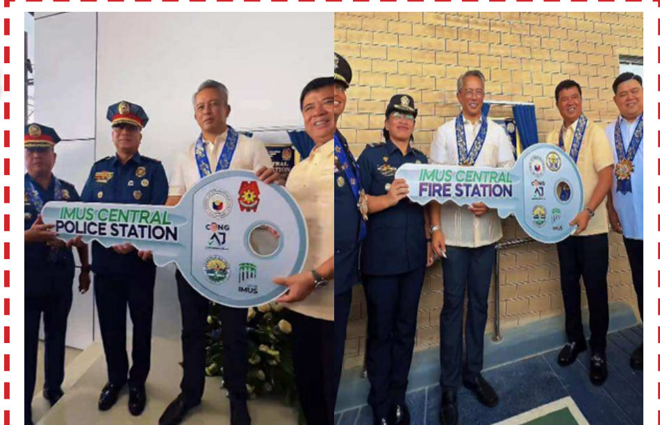
Interior and Local Government Secretary Jonvic Remulla leads the Blessing and Inauguration of the Imus Central Police and Fire Station at Open Canal Road, Brgy. Malagasang II-C, Imus City, June 30, 2025