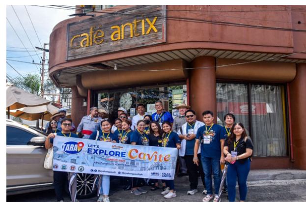
Image 3: Participants after a luncheon at Cafe Antix in Cavite City

General Trias upang masilayan ang St. Francis of Assisi Parish Church—isang simbahan na kilala sa matatag nitong arkitekturang kolonyal na nanatiling buo sa paglipas ng panahon.