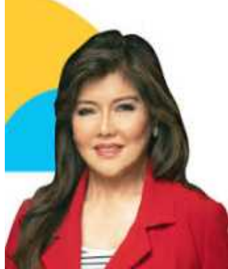
(Sen. Imee Marcos)

Ayon sa senadora, mahalagang ipatupad ang hakbang sa gitna ng umiiral na national state of energy emergency, kung saan patuloy ang pagtaas ng presyo ng langis at mga pangunahing bilihin. Layunin umano nitong mabawasan ang pinansyal na pasanin ng mga Pilipino, lalo na ang mga manggagawa, magsasaka, mangingisda, at mali-