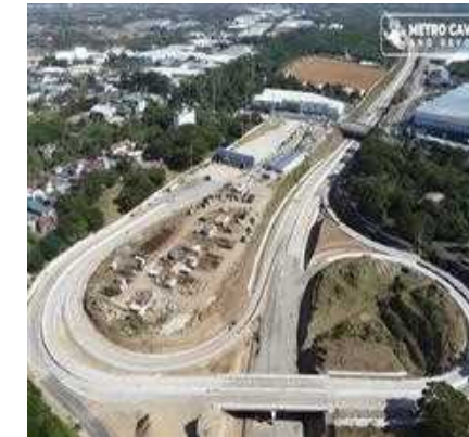
Silang, Tagaytay, and nearby weekend destinations in Laguna.

The Cavite-Laguna Expressway (CALAX) Subsection 3 has been completed and may open before Holy Week. Spanning approximately 7.91 kilometers, this segment connects the Silang (Aguinaldo) Interchange to the Governor's Drive Interchange. It is expected to significantly ease traffic congestion along Governor's Drive and Aguinaldo Highway, while providing more convenient access for travelers to and from