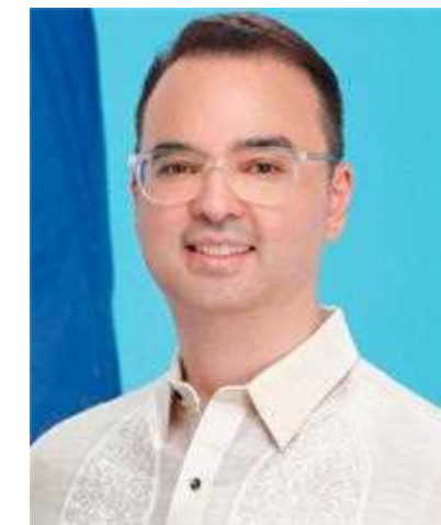
Sen. Alan Peter Cayetano

Matatandaang nitong mga nakaraang linggo, pinagtibay ng Senado ang Senate