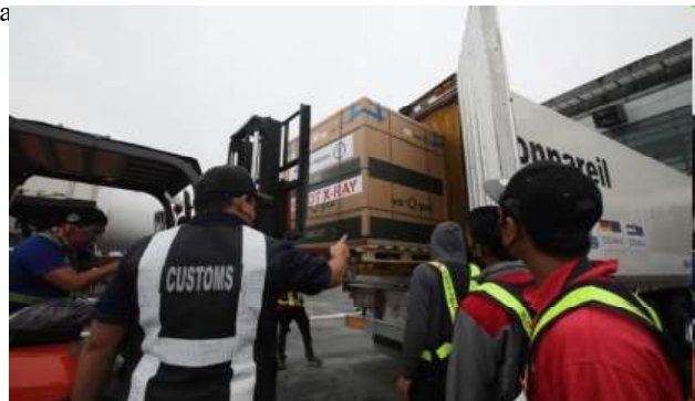
DONATIONS. The boxes containing 1,062,100 doses of the Moderna Covid-19 vaccine are loaded into a refrigerated container truck at Ninoy Aquino International Airport Terminal 3 on Sunday (Dec. 19, 2021). The jabs are donations from the German government.

So far, the national government has already administered over 100 million Covid-19 vaccine doses since March, with at least 43 million already fully vaccinated as of December 16.