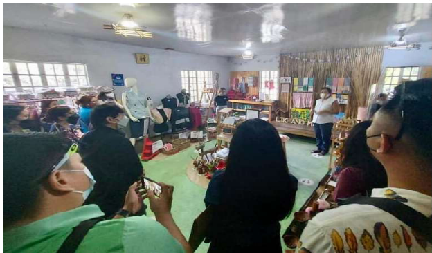
Among the sites visited, which form part of the GCI circuit in Cavite, include: Maragondon River Cruise, Riverfront Garden

Spearheaded by the Department of Tourism Region IV-A, travel agents, tour operators, and government agencies such as the Department of Health, the Philippine Information Agency, the Tourism Promotions Board as well as the local tourism officers of Alfonso, Maragondon, Silang, and Tagaytay City took part in the assessment activity, ensuring the readiness of the destinations in terms of the implementation of health and safety protocols.