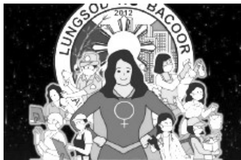
MGA NATATANGING JUANA NG BACOOR SA BARANGAY

Ilan lamang sila sa mahigit 80 na natatanging babae sa lungsod na walang sawang naglaan ng kanilang oras at talento upang makapagsilbi sa kanilang komunidad. (PB)