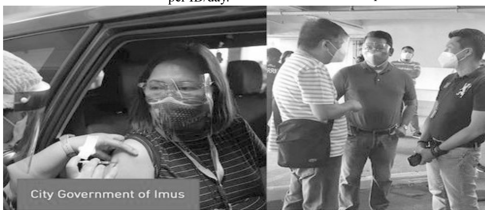
City Government of Imus

?? Cannot be availed in conjunction with any other promo, as well as on Junior, Senior Citizen, PWD and other special rates.