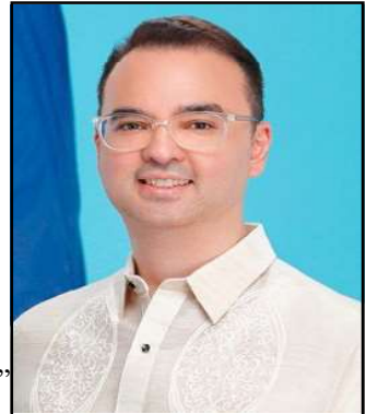
Former House Speaker Alan Peter Cayetano

"Kung titignan mo lahat no, maraming not in our control, katulad nung bagong variation. Pero 'yung pananalapi ng ating bansa, at 'yung kalagayan ng ating kababayan, we are not only