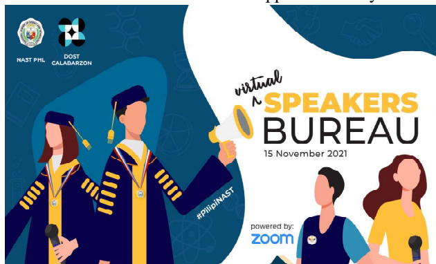
DOST Calabarzon Speakers Bureau highlights importance of governance in post-pandemic recovery

Healthcare Professionals Alliance Against Covid-19 (HPAAC) member and Philippine Academy of Fam-