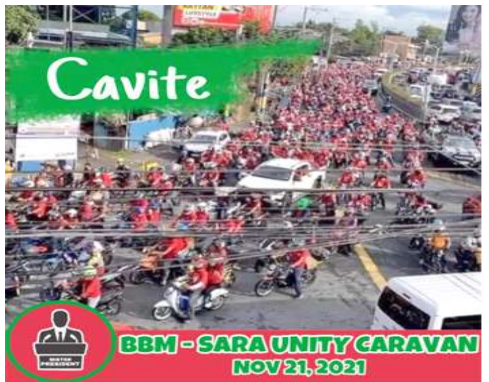
TINGNAN: Dinagsa ng maraming motorista at taga-suporta ang ginaganap na motorcade para kay Presidential Aspirant Bong Bong Marcos sa Cavite.