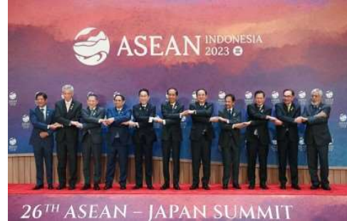
26 th ASEAN – JAPAN SUMMIT

MANILA – President Ferdinand R. Marcos Jr. on Thursday reported a fruitful outcome of his participation in the 43rd ASEAN Summit and Related Summits in Jakarta, Indonesia, where he advanced the country’s interest in the regional gathering, mutual interest.