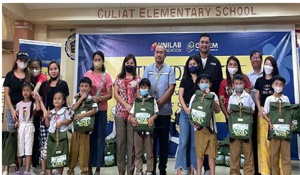
Ang mga mag-aaral at magulang ng Culiat Elementary School na binigyan ng Juander Kits kasama ang mga opisyal ng Unilab Foundation.