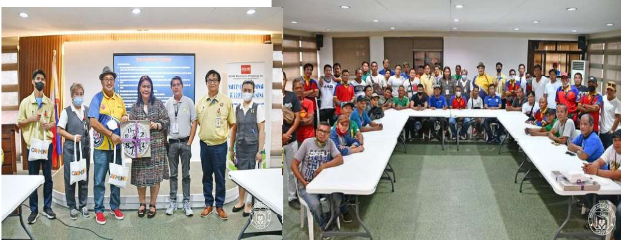
Municipal Tricycle Franchising and Regulatory Board (MTFRB), with ROHM Electronics Philippines, Inc., leads the Road Safety Seminar for tricycle drivers in Carmona.

This is in celebration of Road Safety Month and in accordance with Sustainable Development Goal No. 11 Sustainable Cities and Communities: Make cities and human settlements inclusive, safe, resilient and sustainable. This activity aims to increase the knowledge of tricycle drivers about safety driving to avoid any kind of road accidents.