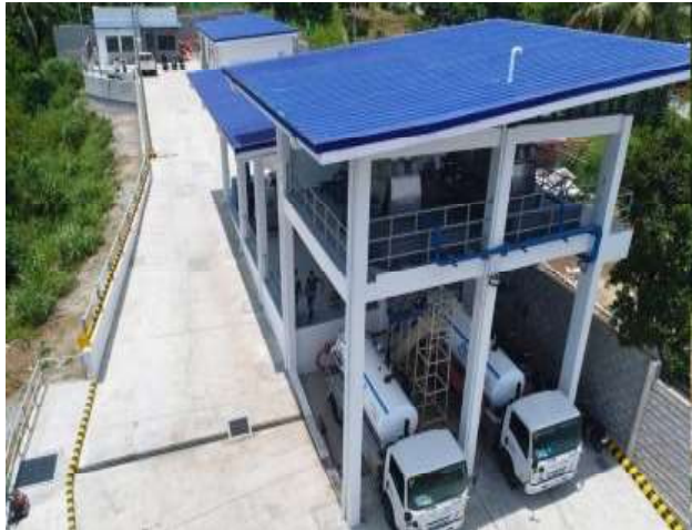
Tagaytay's first septage treatment plant

“Recognizing the importance of reliable and sus-