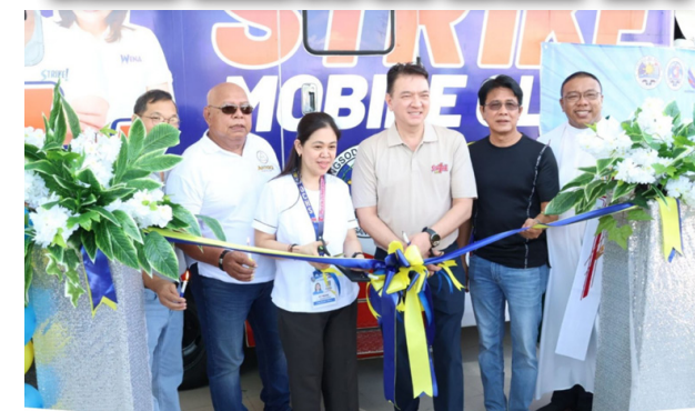
Mayor Strike B. Revilla Launches And Blesses Strike Mobile Clinic, Expanding Access To Healthcare In Bacoor

Bacoor City - The City Government of Bacoor, through the Office of the City Health Services (OCHS), today launched and blessed the "Strike