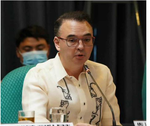
see page 6...

Senator Alan Peter Cayetano on Thursday appealed to the Senate to carefully consider its stance on online gambling, emphasizing the government's trillion-peso investment in education and warning that normalization of gambling and addiction undermines Filipino youth.