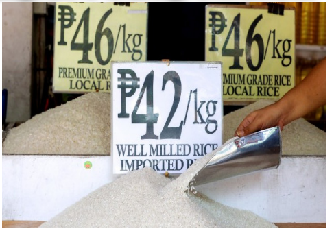
effect until 2028.

Officials review the tariff cut every four months to assess its impact on prices and supply, and it will remain in