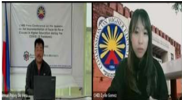
REGARDLESS OF VAX STATUS. Commission on Higher Education chairperson J. Prospero de Vera III announces a new policy allowing the unvaccinated to attend face-to-face classes during a virtual briefing on Monday (Aug. 29, 2022). The new policy covers students, teachers and non-teaching personnel. (Screengrab)

“We are changing it because vaccination levels are already high in the higher education institutions, the percentage of at-risk individuals is significantly lower now, and therefore easier to control on the part of our HEIs, and just like in other countries... we have already learned about how other countries have been doing it and applying it, and of course the views of our