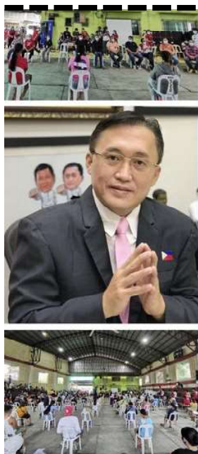
BONG GO PUSHES FOR NATIONAL HOUSING DEVELOPMENT, PRODUCTION AND FINANCING (NHDPF) BILL TO PROVIDE HOUSING FOR THE POOR, DISTRIBUTES AID TO TALISAY CITY FIRE VICTIMS

To date, Metro Manila, Batangas, Bulacan, and Tacloban City are under the general community quarantine while Iligan City, Bacolod City, and the province of Lanao del Sur are under modified enhanced community quarantine until Sept. 30. (PNA)