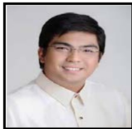
Isang Matapang na Tagapagtanggol ng Manggagawang Taga-CALABARZON: Si Cong. Jolo Revilla, patuloy na lumalaban para sa mas mataas na sahod ng mga manggagawa sa rehiyon!

la, patuloy na lumalaban para sa mas mataas na sahod ng mga manggagawa sa rehiyon!