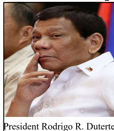
President Rodrigo R. Duterte

The three new Covid-19 patients in the country