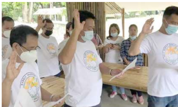
Rabbitry Backyard Raising Livelihood Program.

Matatandaang nito lamang Mayo ay nagawang maggunita ng lungsod ang