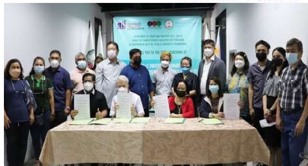
Center of Innovation (CCOI), New CEAT Bldg. ng DLSU-D kung saan matatagpuan ang InnoLab.