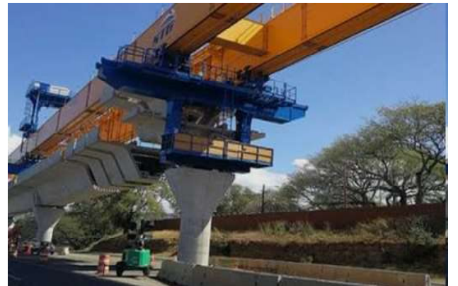
Las Piñas kasi sinara nila doon,"

"Biglaan lang 'yung ginawa nila. Minsan perwisyo. Kaninang umaga, walang masakyan papuntang