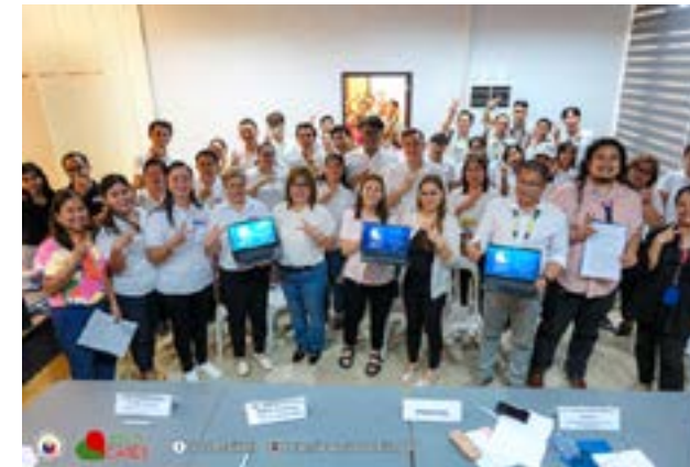
MGA GURO NG PUBLIC SCHOOLS AT CvsU- CCAT SA ROSARIO, DUMALO SA TRAINING AT NAKATANGGAP NG BAGONG LAPTOPS SA ILALIM NG PROJECT CLICK

Ginanap po ngayong araw ang ceremonial distribution at turnover ceremony ng mga bagong laptops matapos ang dalawang araw na pagsasanay sa digital literacy ng mga piling guro mula sa iba't ibang pampublikong paaralan at pamantasan sa Rosario, Cavite sa ilalim ng Courses for Literacy in Internet and Computer Knowledge o PROJECT CLICK ng Department of Information and Communications Technology (DICT).