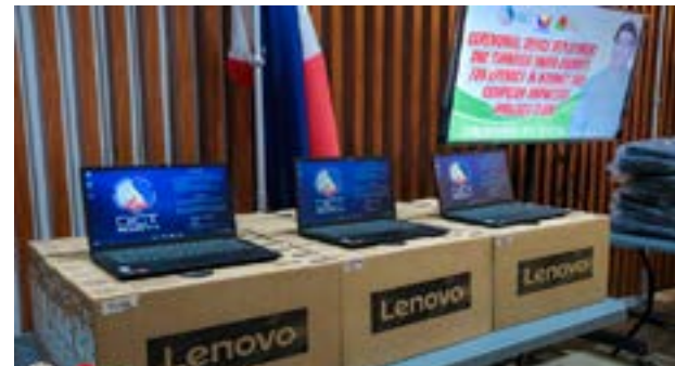
Nagpapasalamat ng DICT at sa mga school principal and administra-

tor na dumalo at nakiisa sa proyektong ito para sa kanilang patuloy na suportang ating mga adhikain at para sa kanilang pagsusumikap na mabigyan ng dekalidad at napapanahong edukasyon ang ating mga kabataan. Maipasa nawa natin sa iba ang lahat ng mga kaalaman na ating nakuha mula sa karana-