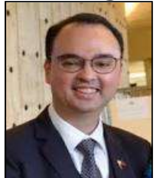
Former House Speaker Alan Peter Cayetano

Nagbigay si dating Speaker Alan Peter Cayetano at kanyang mga kaalyado mula sa kilusang Balik sa Tamang Serbisyo (BTS) sa Kongreso ng P10,000 na cash na tulong bawat isa sa halos 200 na mga benepisyaryo mula sa buong Pilipinas noong Sabado, Mayo 1, bilang bahagi ng kanilang kampanya para sa agarang pagpasa ng panukalang 10K Ayuda Bill at sa pagdiriwang ng Araw ng Manggagawa.