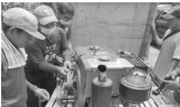
DAR, NAGHANDOG NG WATER PUMP SA MGA VOLUNTEER NG 'BUHAY SA GULAY' SA CAVITE

Naghandog ang Department of Agrarian Reform (DAR) ng water pump sa Barangay Baliwag sa bayan ng Magallanes na magagamit ng mga residente sa urban gardening at farming.