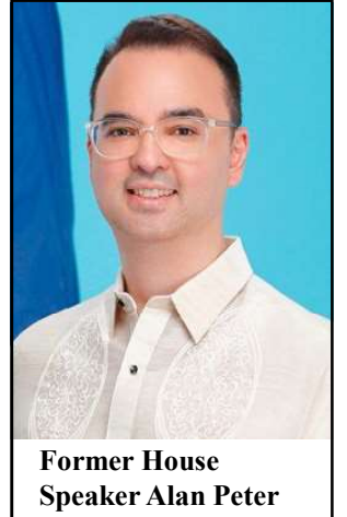
Former House Speaker Alan Peter

In 2012, the Philippines lost the Panatag Shoal, also called Scarborough Shoal in the WPS, to Beijing after a standoff that erupted when Manila sent its biggest