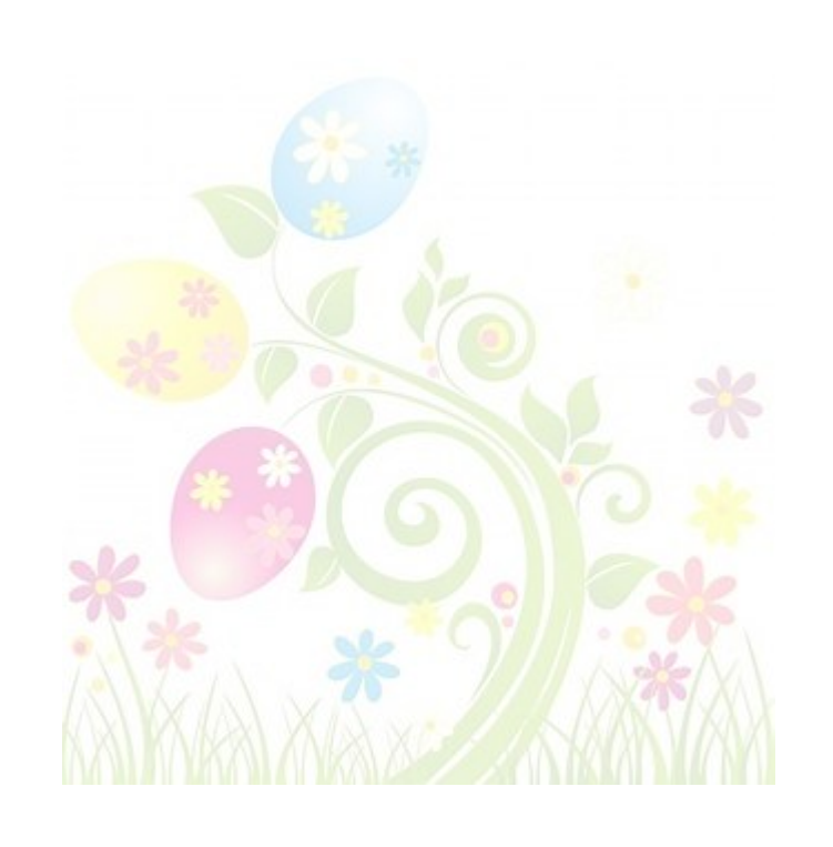
Easter April 20, 2025