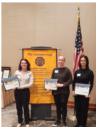
The winners of the BCNOC Essay Contest