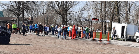
The start of the Race By The Bay Run for the adults