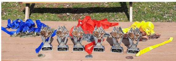
The "BOOTY" that awaits the winners of today's event