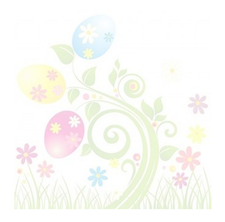
Easter April 20, 2025