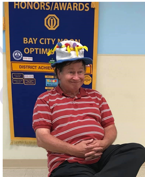
Dr. Phil also looking mighty precious in the hat