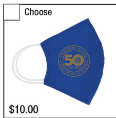
50th Anniversary Face Mask