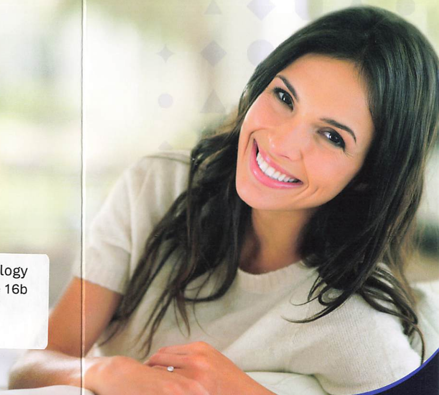
Photo-ready skin every day