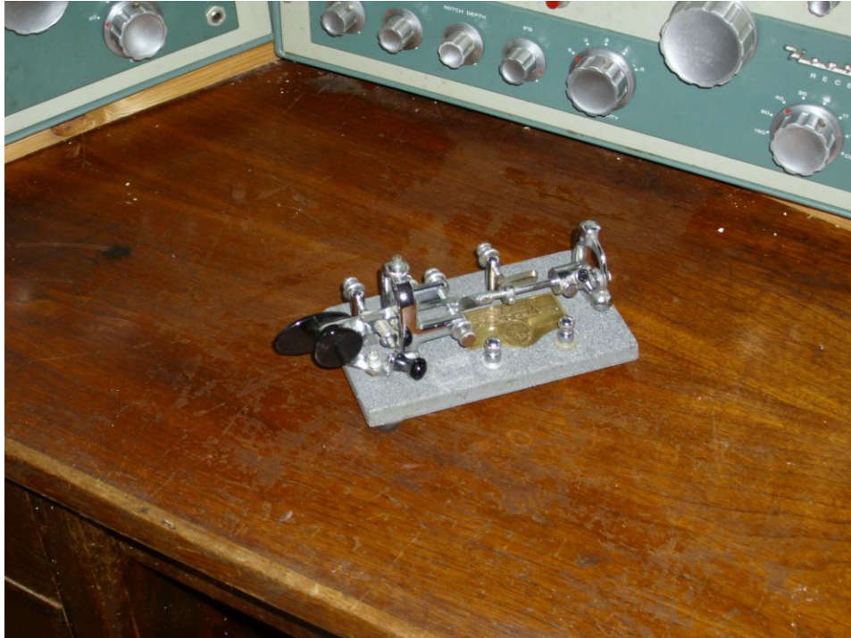
Vibroplex "Original" This was my Christmas present in 1960