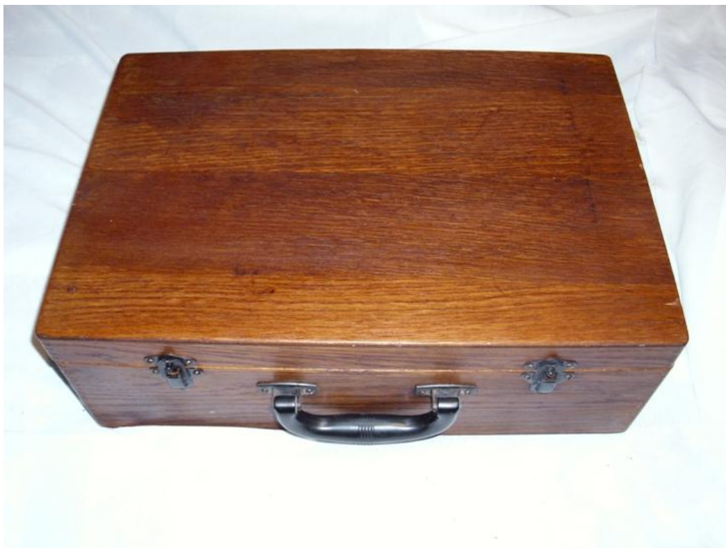
Outside of Model 201 Tube Tester