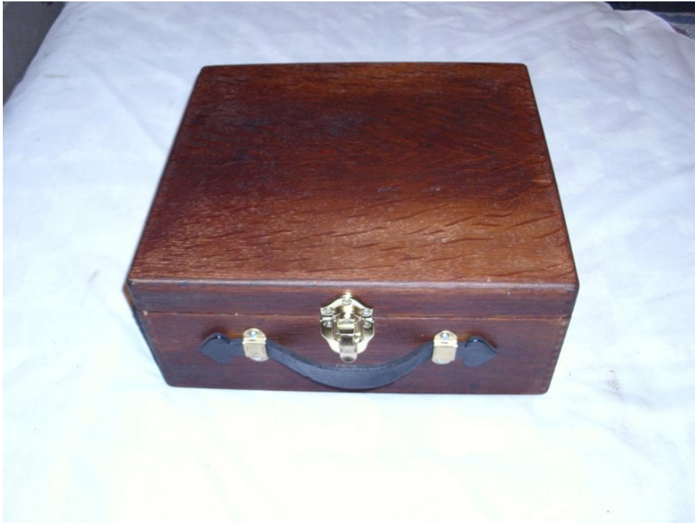
Cabinet for Supreme 85 Tube Tester