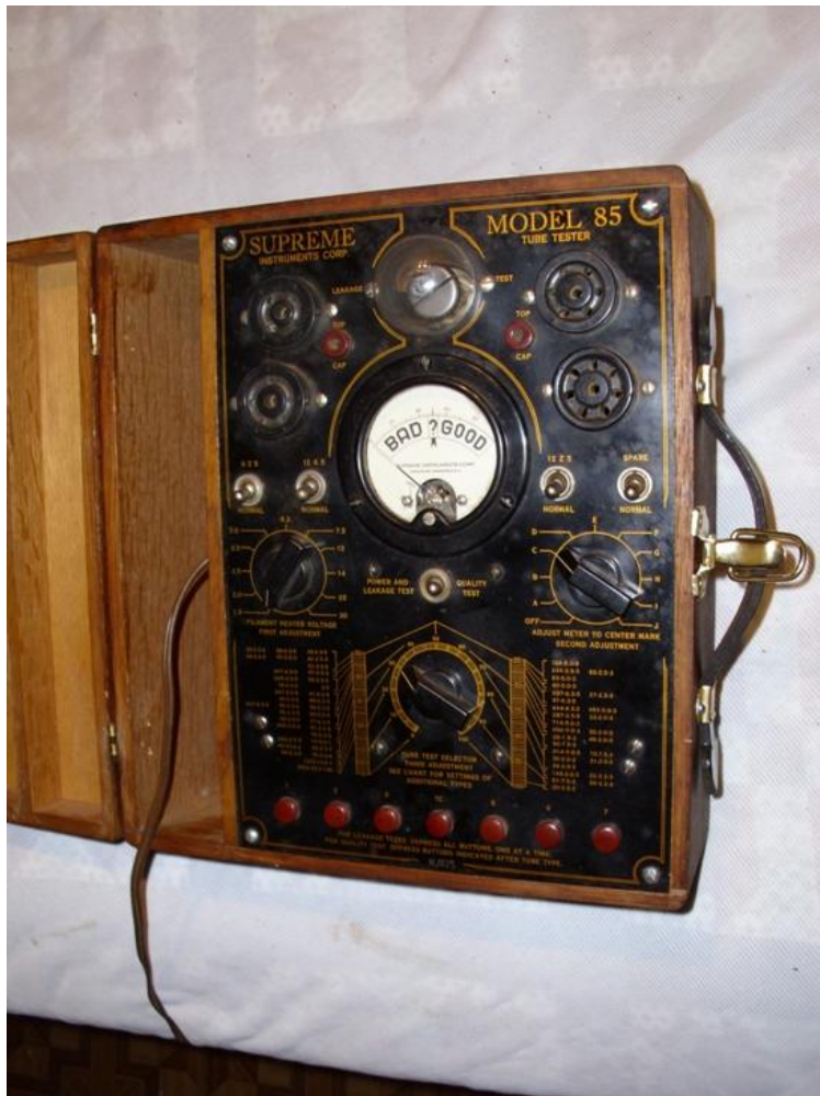
Supreme 85 Tube Tester (1932)