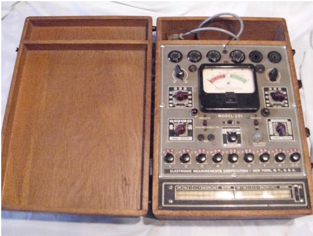
Electronic Measurements Model 201 Tube Tester (1936 Model)