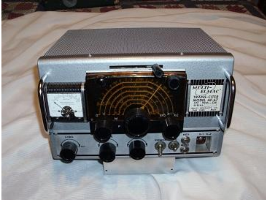
Multi-Elmac AF-67 transmitter