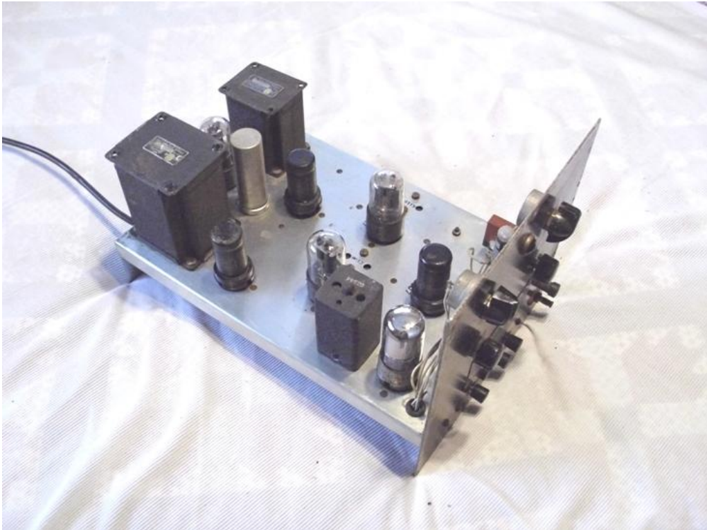
Meissner 9-1073A Frequency Standard (1943)