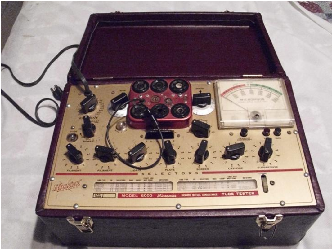
Hickock Model 6000 Tube Tester