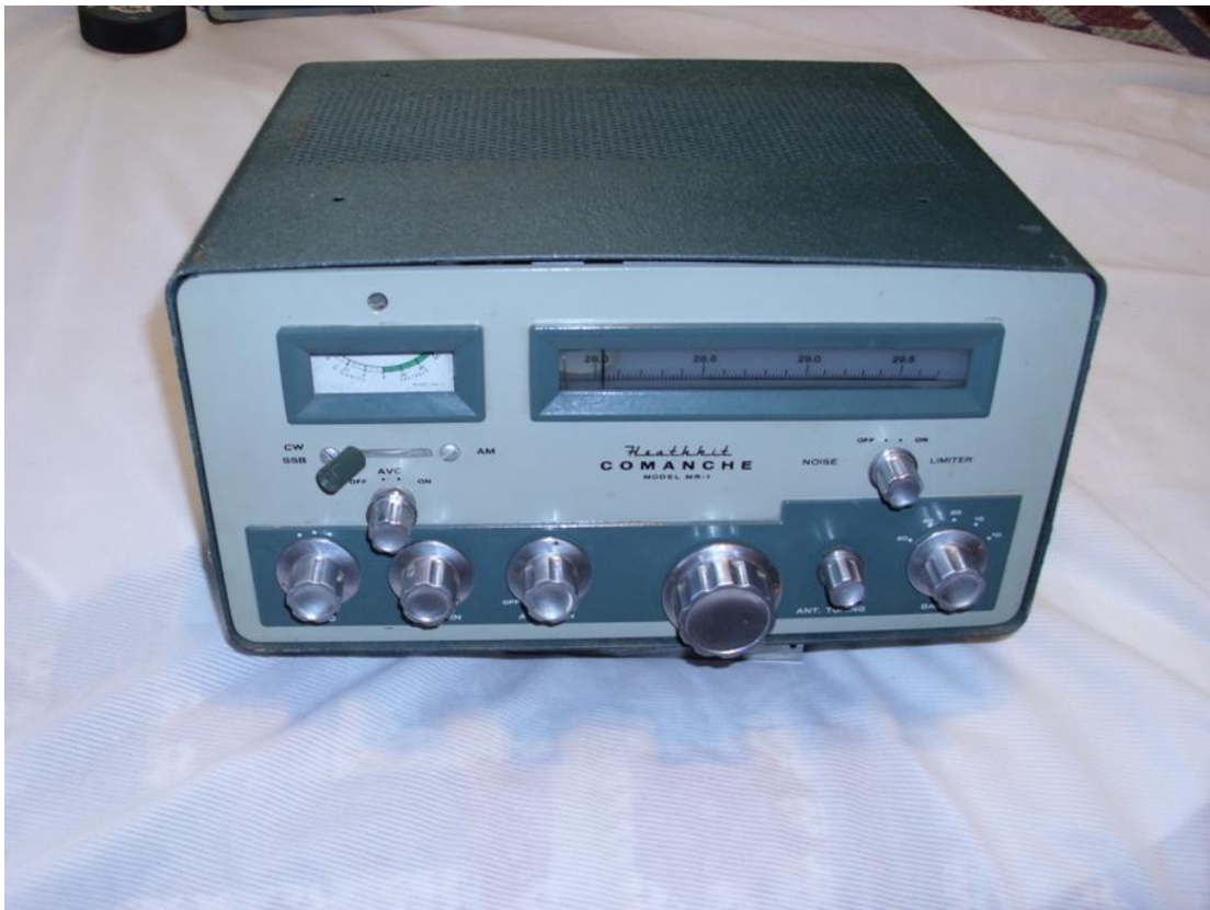
Heath MR-1 "Comanche" receiver