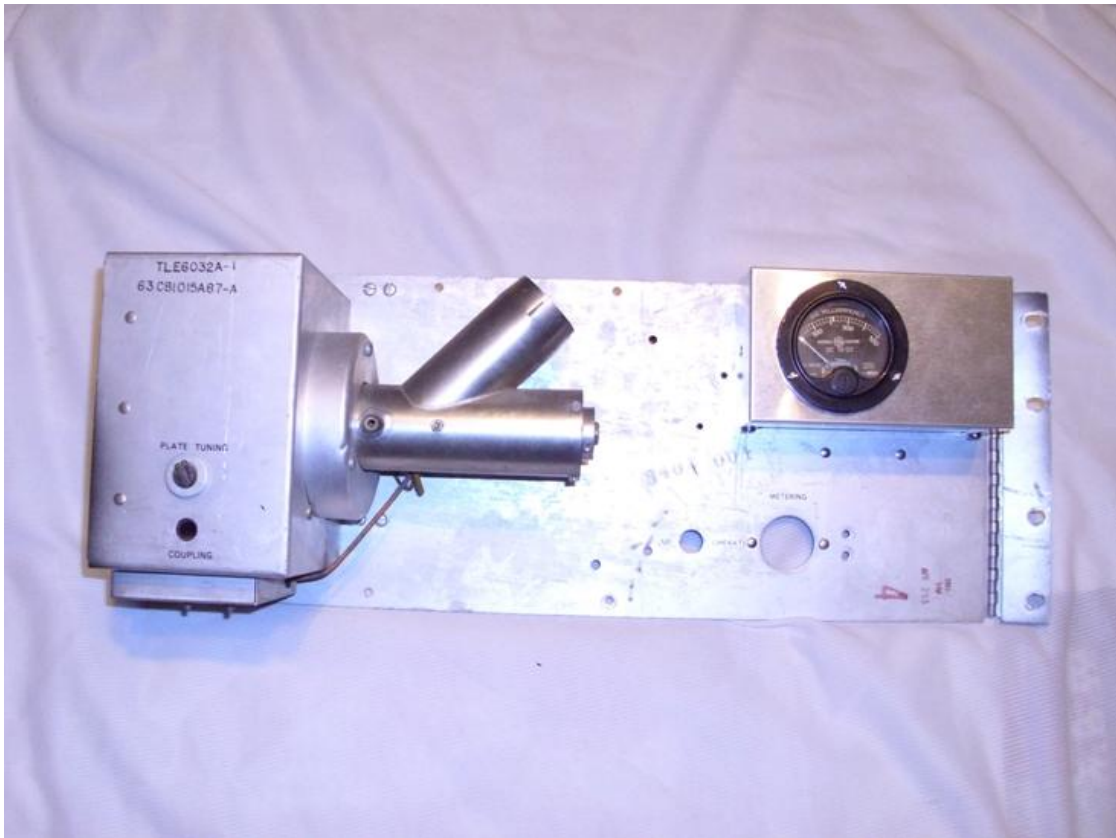
Motorola "B" amplifier Restored and modified as a linear amplifier on 432 MHz