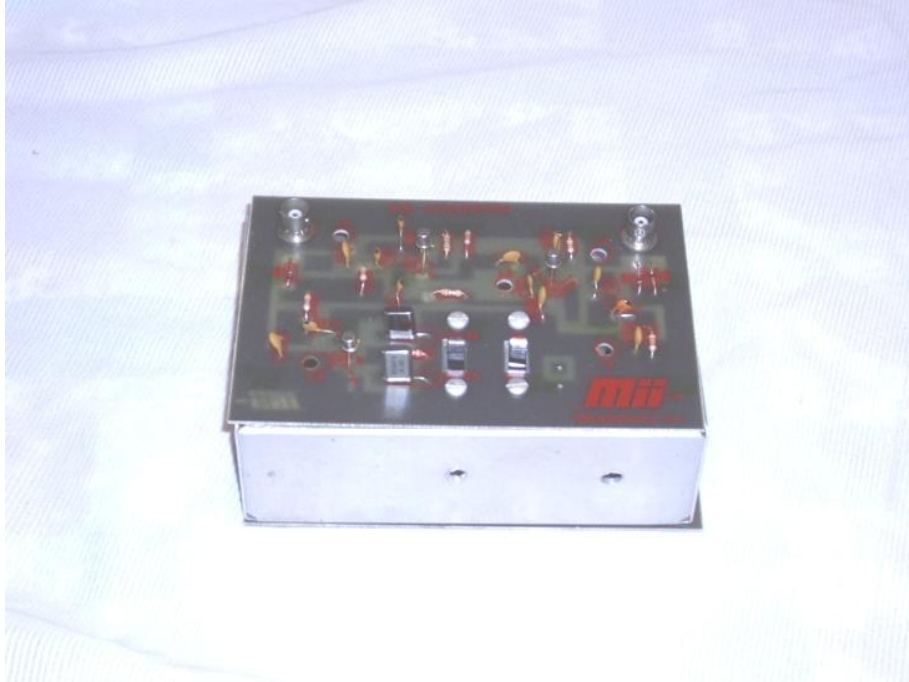
Micropac 6-meter converter Originally designed by K9STH as a product line in 1969