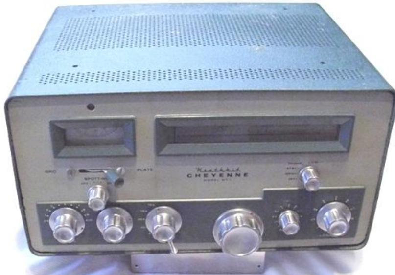
Heath MT-1 "Cheyenne" transmitter