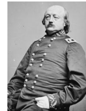
Benjamin Butler 5 November 1818