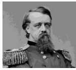
Alfred H. Terry 10 November 1827