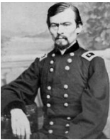
Franz Sigel 18 November 1824