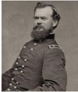
James B. McPherson 14 November 1828