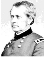
Joseph Hooker 13 November 1814